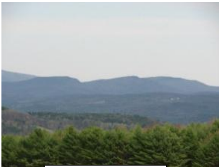
View from Happy Hill Shelter, Norwich, VT

Hurricane Forest Wildlife Refuge Trails Reservoir Road White River Junction, VT