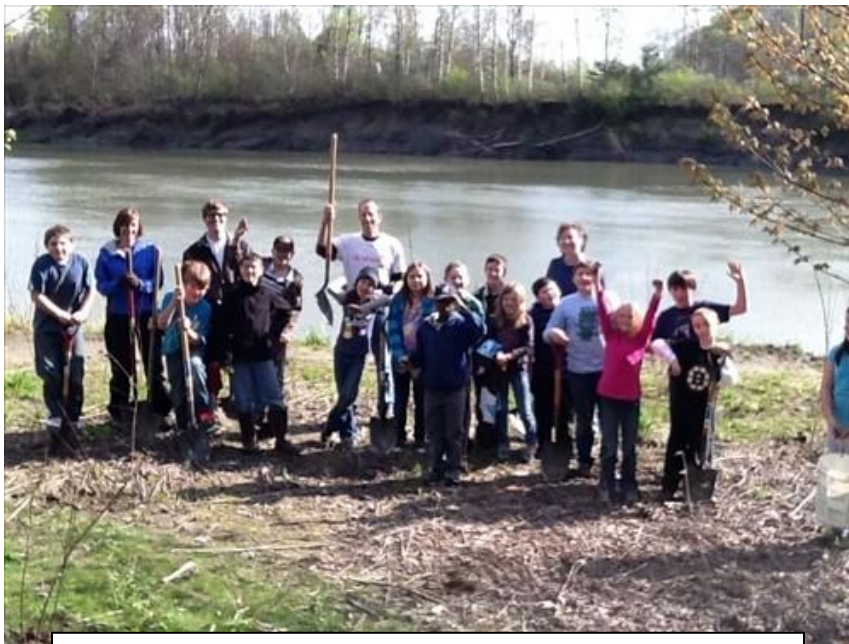
2012 Tree planting at Lyman Point Park after the flood

King Arthur Flour Bakers Store and Baking Education Center 135 Route 5 South Norwich, VT 802-649-3361